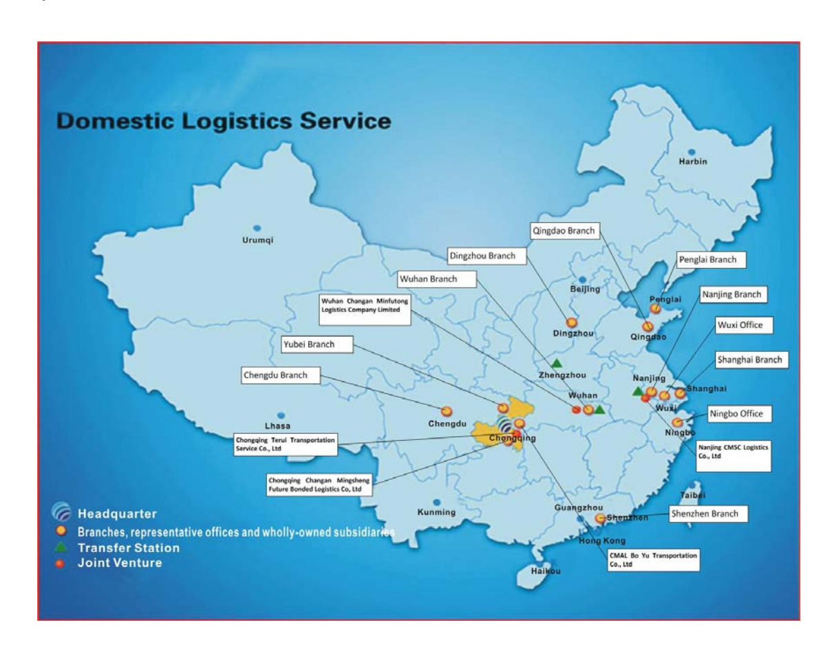
Chart 2: Location of the Company's existing branches, subsidiaries and representative offices